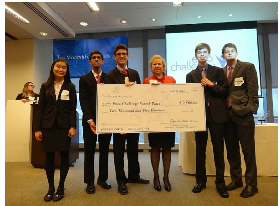
Trinity Preparatory School