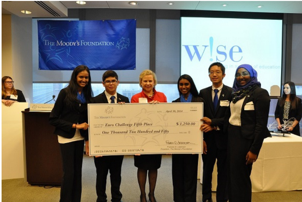
Nova High School