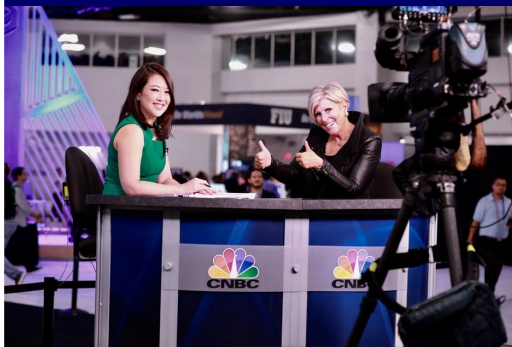
CNBC's Melissa Lee interviews Suze Orman

Journey through Innovation - June 12-13, 2017