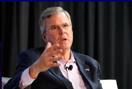
Jeb Bush, Former Florida Governor and GOP presidential candidate