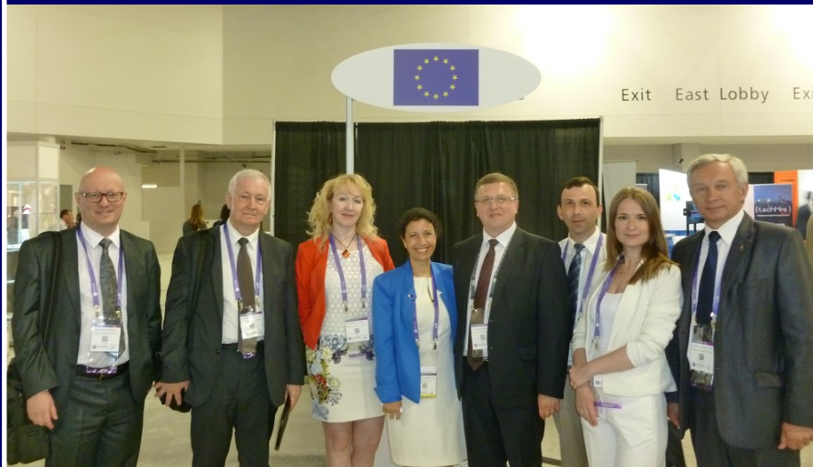
At the Horizon 2020 booth, Belarus Delegation