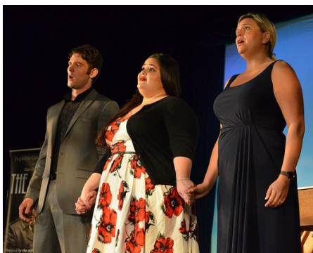
Performers from the Florida Grand Opera

This event was organized by the Florida Grand Opera and the FIU School of International and Public Affairs' European Studies Program and Václav Havel Initiative for Human Rights & Diplomacy.