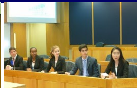
At the competition, Trinity Preparatory School team making their presentation before the judges