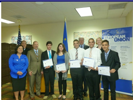
Felix Varela Senior High School Students receiving their certificates