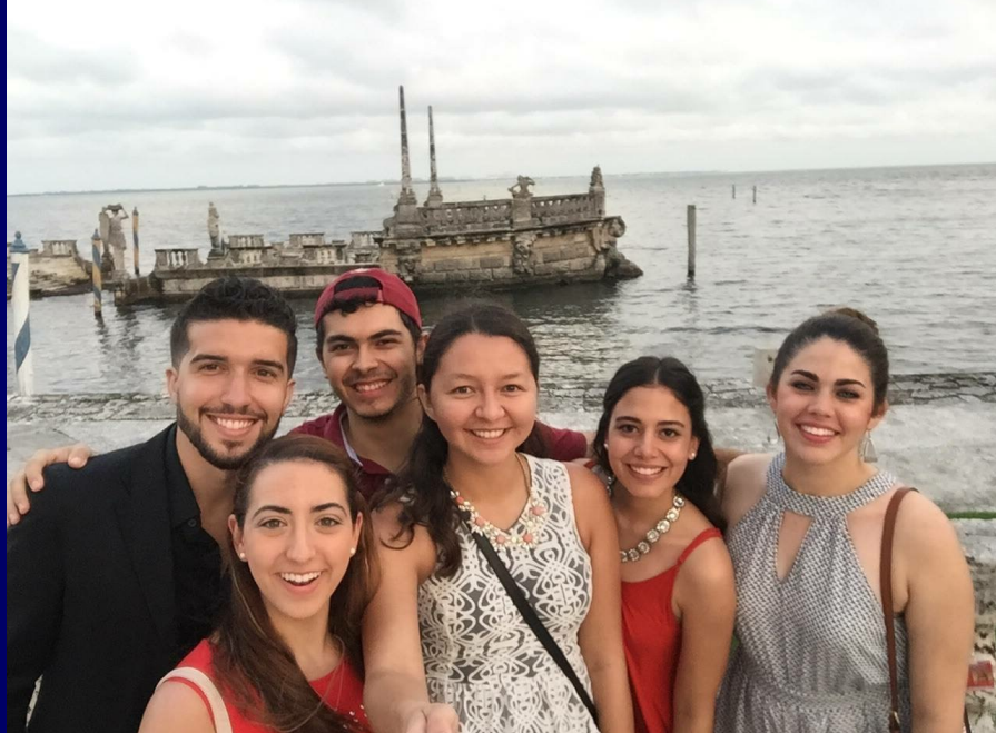
Students from the FIU Honors College Study Abroad France and Italy Program at Vizcaya

To see the results of the City As Text Project you can visit www.fiuhcitaly.wordpress.com and www.fiuhcfrance.wordpress.com .