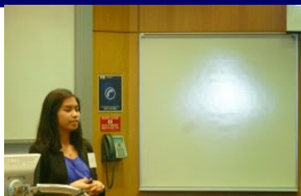
At the competition, one of Oasis High School students making her presentation before the judges