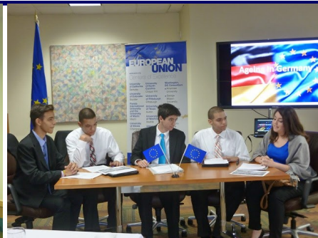
Felix Varela Senior HS Students presenting their project "Germany and Aging Population" to the audience

On March 31st, the Miami-Florida European Union Center of Excellence organized a Recognition Award Ceremony Luncheon for the two Florida high schools winning teams at the Local Euro Challenge Competition 2015, Felix Varela Senior High School and Trinity Preparatory School. The event took place at the Federal Reserve Bank of Atlanta Miami-Branch where students, teachers, judges and organizers were acknowledged and congratulated for their tremendous work.