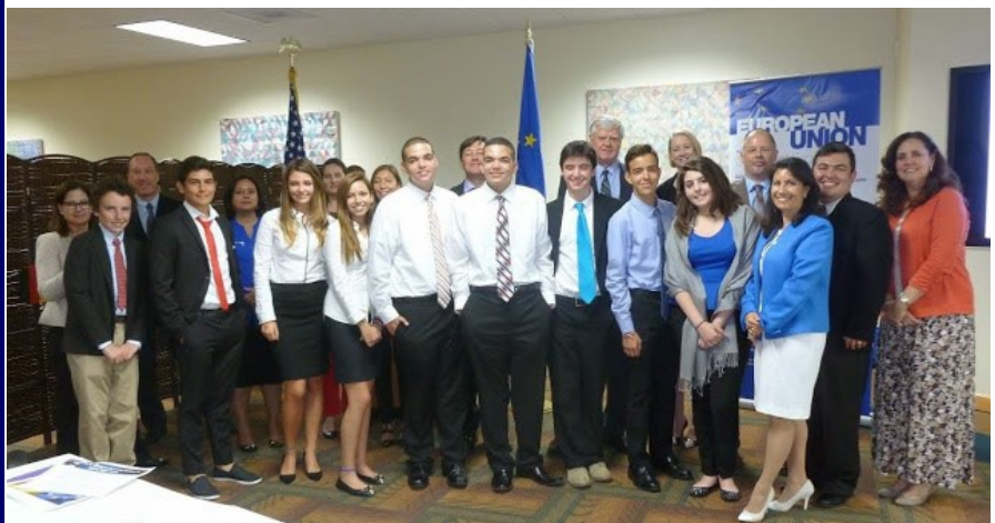
Euro Challenge Competition Recognition Award Ceremony at the FED—March 31, 2015

communication, critical thinking and team skills among their students. She also awarded certificates of appreciation to the judges and thanked them for their continuing support, and for making the competition fair and transparent.