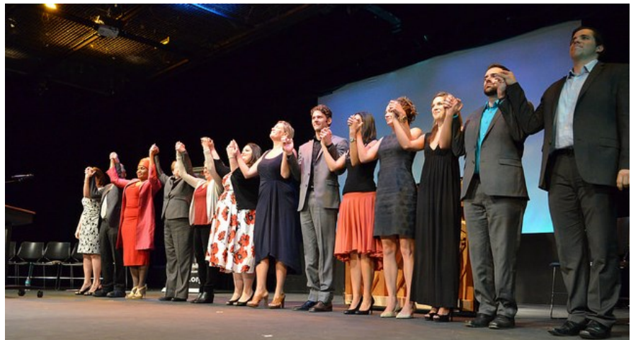
Performers from the Florida Grand Opera and guests speakers take a bow at the end of the event