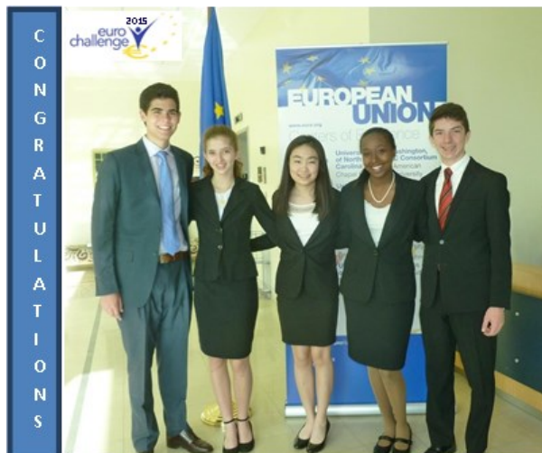
Trinity Preparatory School

For more information on the Euro Challenge Competition and to view photos click here . For more information, click here