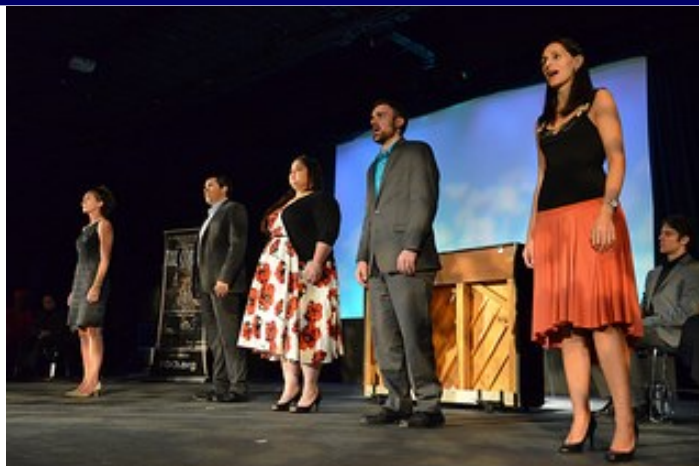
Performers from the Florida Grand Opera