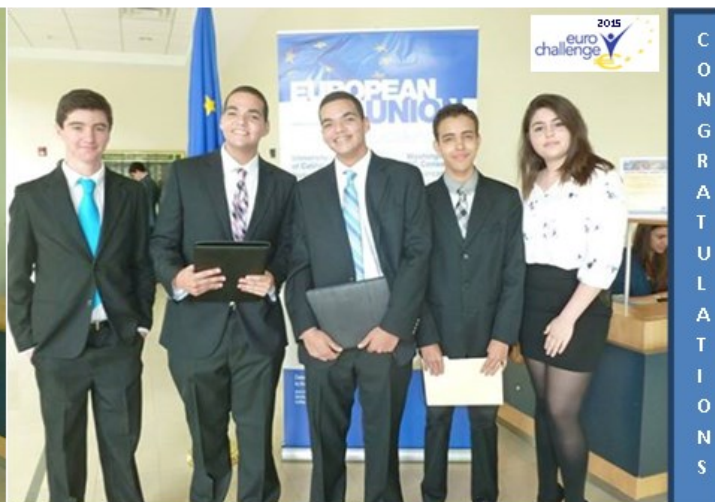
Felix Varela Senior High School