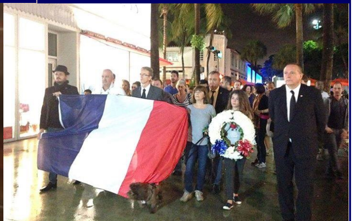
Left: At the Consulate General of France in Miami—1st vigil -Nov. 14, 2015 Right: in Miami Beach, the French and American community members march together

Candlelight Vigil for Peace and Remembrance for the events in Paris on November 13th