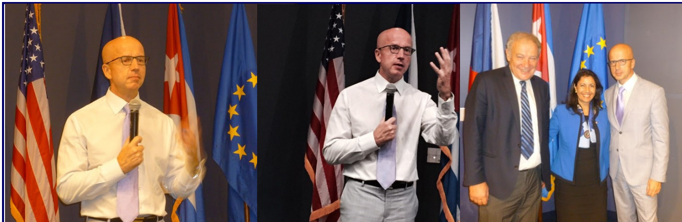
Pavel Telička, EU Parliament Member