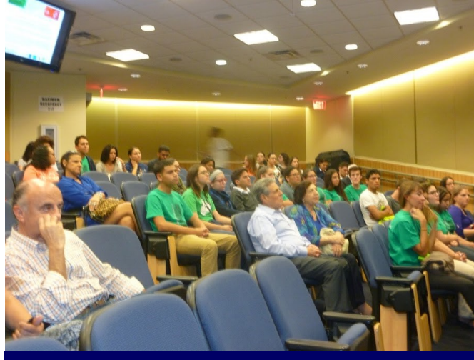
Audience at Italy Day