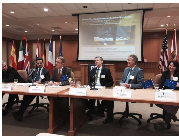
Panel Discussion on “The Death Penalty: European Union and International Perspectives

problematic questions. But there were also reason brought for how the abolition of the death penalty in many US states could be advanced: from highlighting the racial injustice that condemns proportionately more African-American than Caucasians, to using a cost-