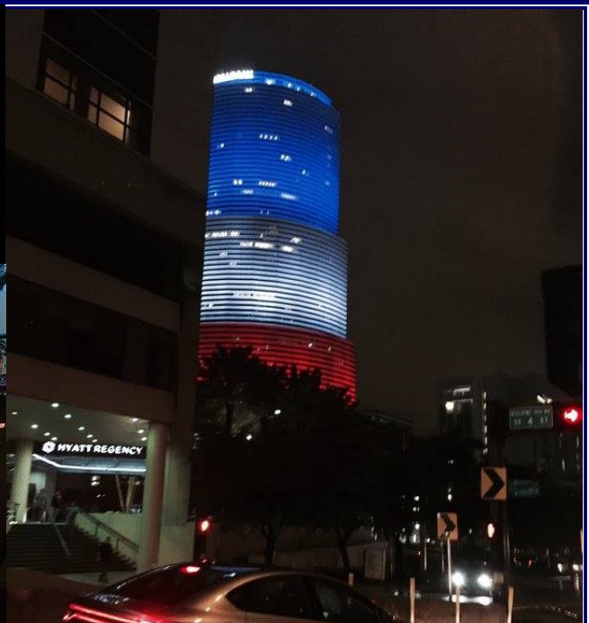
Miami with the Colors of France: blue, white, and red "Freedom, Equality, and Fraternity"