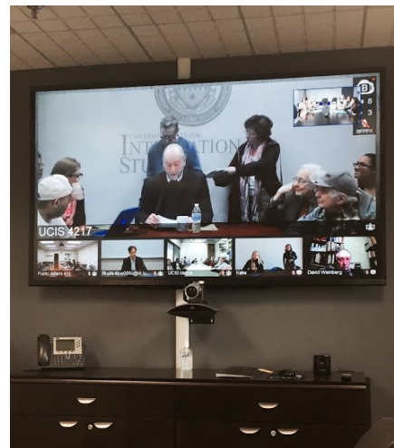
Videoconference with the University of Pittsburgh