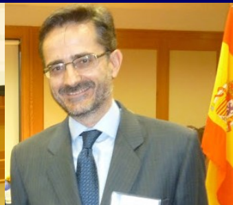
Hon. Candido Creis Consul General of Spain in Miami