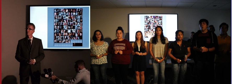
At Florida International University on Nov. 18th, 2015: Candlelight Vigil Peace and Remembrance

Le Cercle Français, Pi Delta Phi, the Department of Modern Languages, BHA, and NPHU