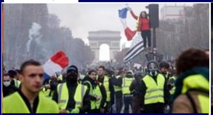
Sept. 19, 2019: "Gilets Jaunes" in France