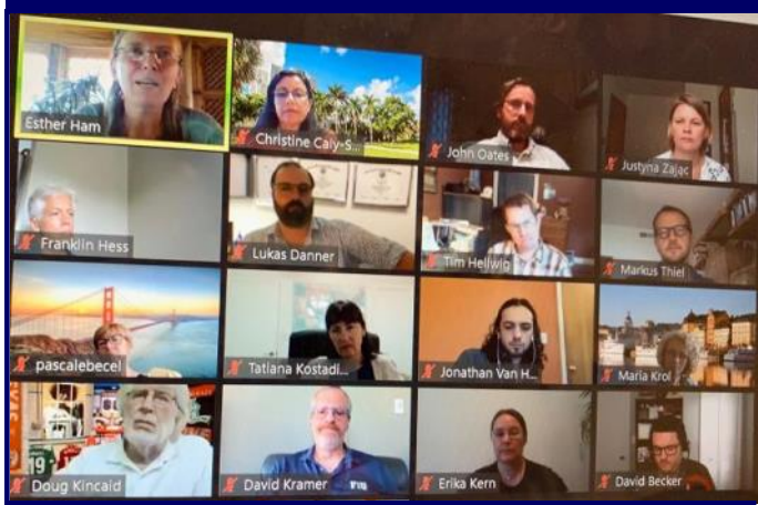
FIU and Indiana Universities faculty at the webinar on How to Teach Europe Online

On June 30, FIU and Indiana University Bloomington faculty met virtually to share their experiences teaching remotely students amid the COVID-19. The workshop titled "How to teach Europe Online" was organized by the Institute for European Studies at the University of Indiana Bloomington and in collaboration with the European & Eurasian Studies Program and the Miami-Florida Jean Monnet Center of Excellence at FIU.