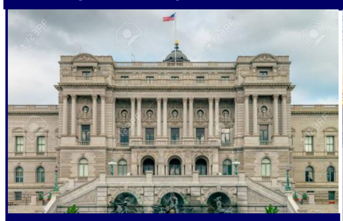
The Library of Congress in D.C.

"My Internships at the MFJMCE and The Library of Congress in D.C."