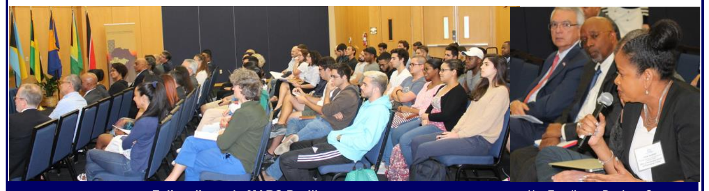
Full audience in MARC Pavilion