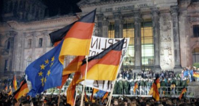
Oct.8, 2019: Germany since 1989

Conversations on Europe is a virtual roundtable series that connects top experts from the US and the EU to discuss contemporary issues in the context of Europe and the transatlantic relationship. The conversations were held every Tuesday of each month during the academic year 2019-2020. Video conference technology allowed for an interaction among the experts and the audiences. Furthermore, technology also enabled us to record some of the events which are available online for the general public. (Find the links in each Conversation.)