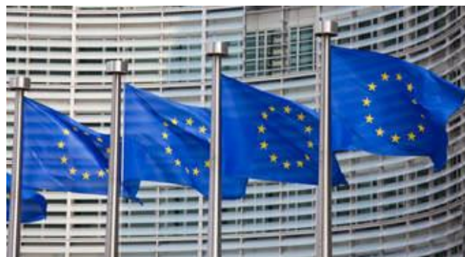
European Commission in Brussels