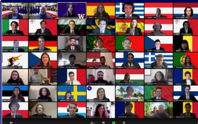
West Coast Model European Union 2021

The Model European Union (MEU) is part of one of MEET EU activities organized by the EU Centers of the University of Pittsburgh, University of North Carolina, and Florida International University.