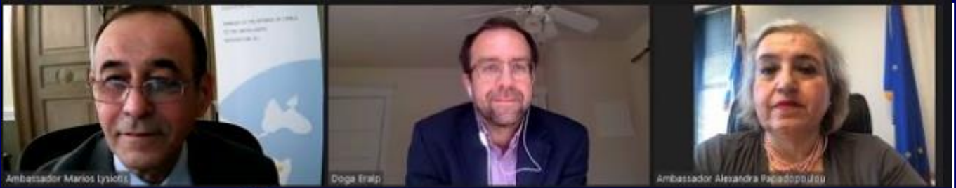
April 6, 2021: Spotlight on the Eastern Mediterranean with Greek and Cypriot Ambassadors to the US