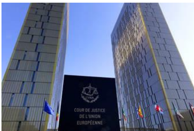
European Court of Justice in Luxembourg

► For more information on the Brussels Lux Study Tour, click here