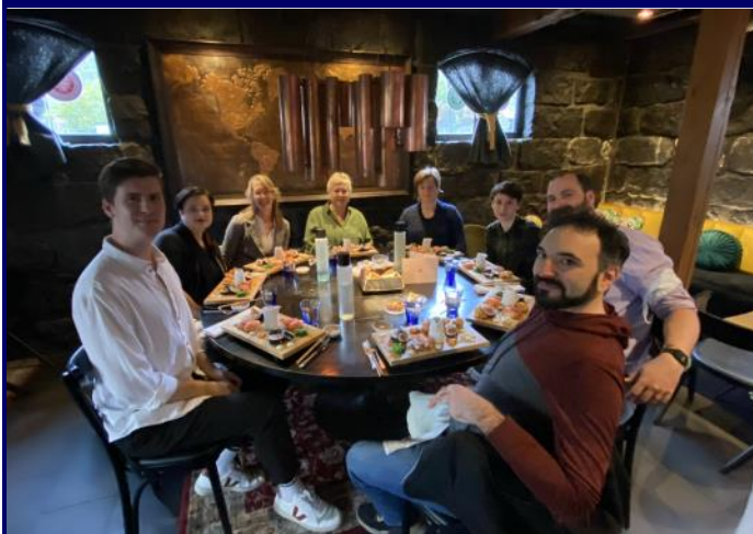
Lunch with Fulbright Iceland Colleagues