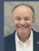
Gen. Philip Breedlove Distinguished Professor of the Practice Sam Nunn School of International Affairs