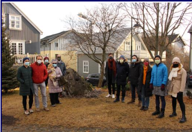
Fulbright Iceland US Scholar Cohort 2020-2021 in downtown Reykjavik