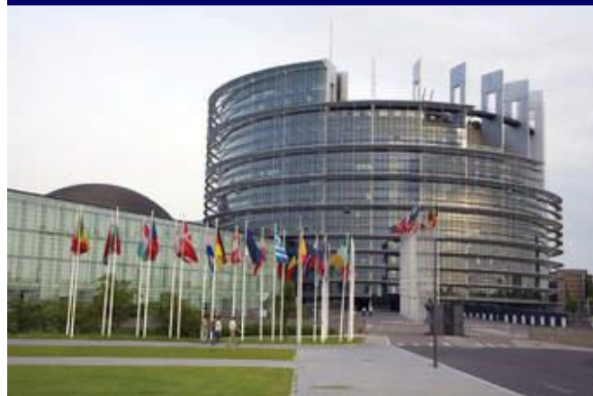
European Parliament in Brussels