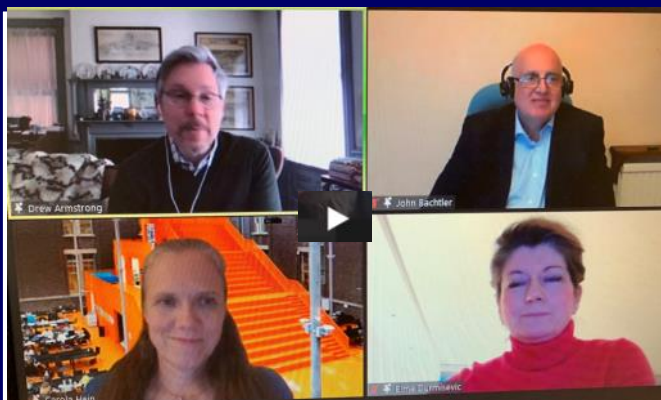
Creating Europe through the Built Environment