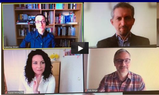
Creating Europe through Multilingualism