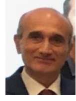
Lucio Taglione Vice Consul Consulate General of Italy

This event is free and open to the public but registration is required