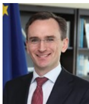
Clément Leclerc Consul General of France