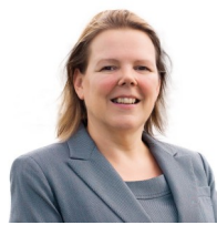
Gera Sneller Consul General of the Kingdom of the Netherlands