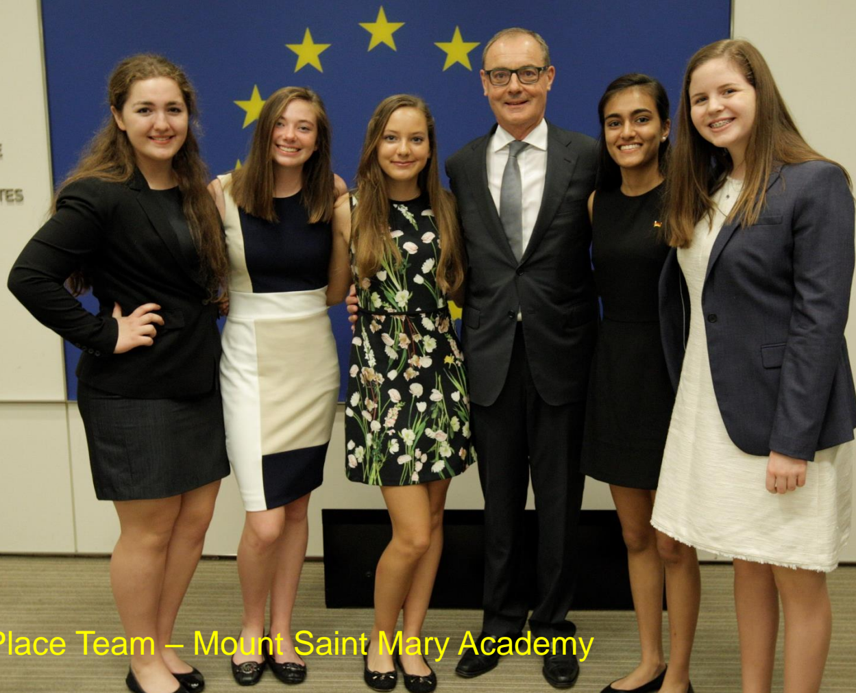
2017 First Place Team – Mount Saint Mary Academy