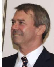
Catalin Ghenea Consul General of Romania