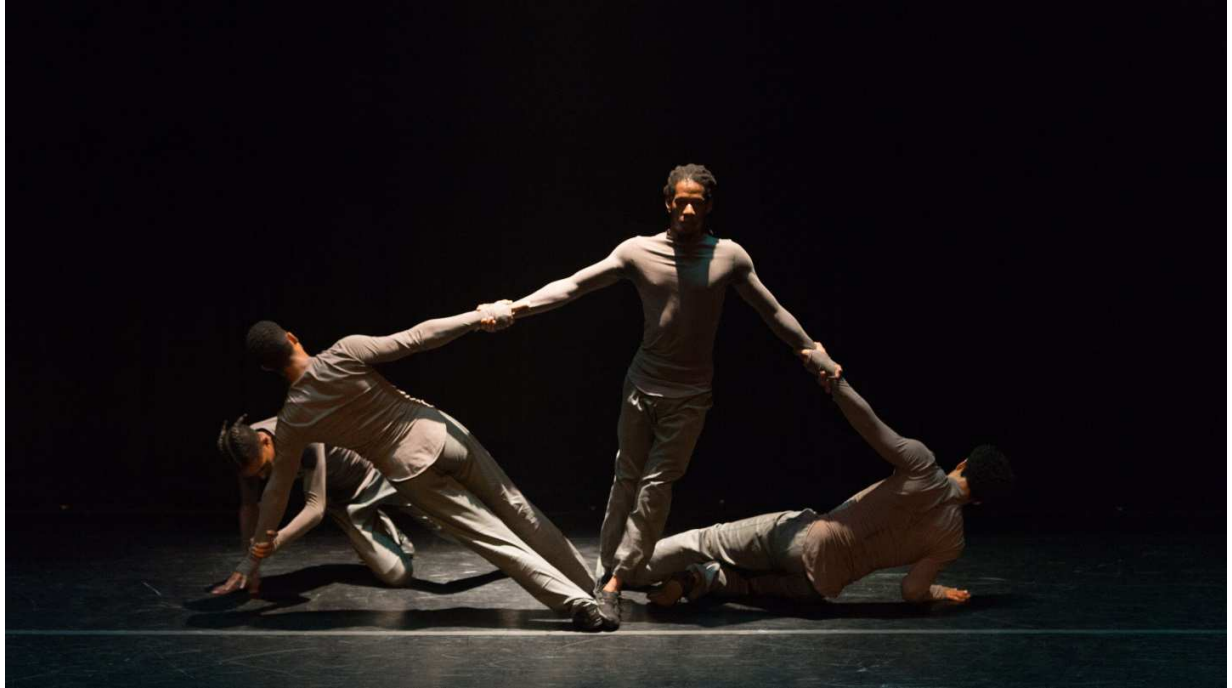
“Biosphere” by Mounka Company at the LHCC