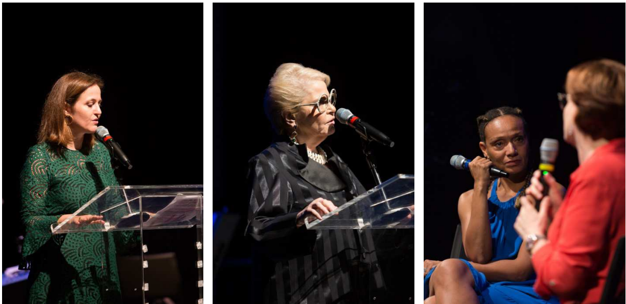
Opening Ceremony with B.de Montlaur, B. Steinbaum, F. Glissant and V.Loichot at the Koubek Center

The festival benefited from the official presence of the Consul General of France in Miami, Clément Leclerc , as well as that of Cultural counselor of the French Embassy to the United States, Bénédicte de Montlaur . Mrs. Christiane Taubira , former Minister of Justice of France, remained the Cultural Ambassador of the Festival at large.