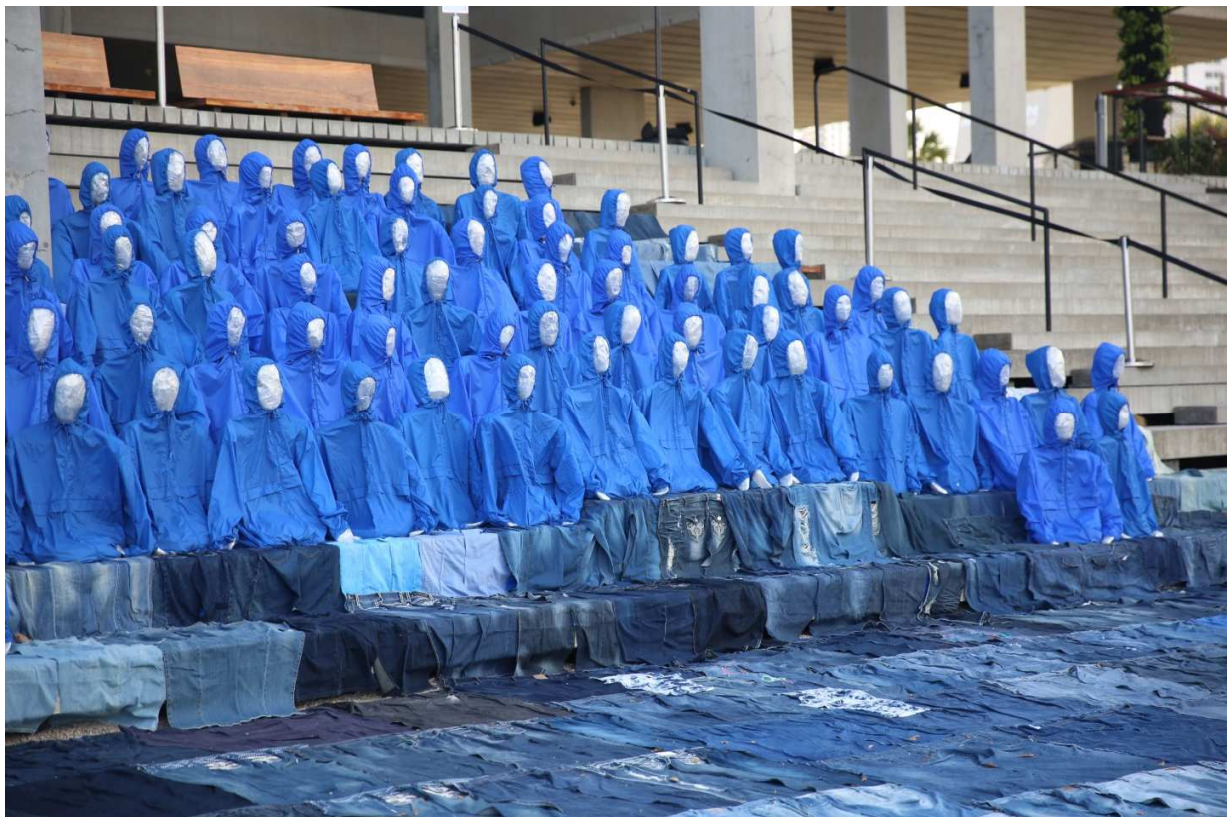
© Photo: David di san Bonifacio - Yué#Sorority installation by Guy Gabon at PAMM

The Festival presented 48 artists from the Caribbean through 2 exhibitions (still on view through 17 th and 30 th of April 2019 at the LHCC and the Wolfsonian-FIU), 1 in situ installation , 4 performances , 3 music concerts , 2 dance shows , 7 short films , 1 theater play , 4 professional workshops , 2 youth program .