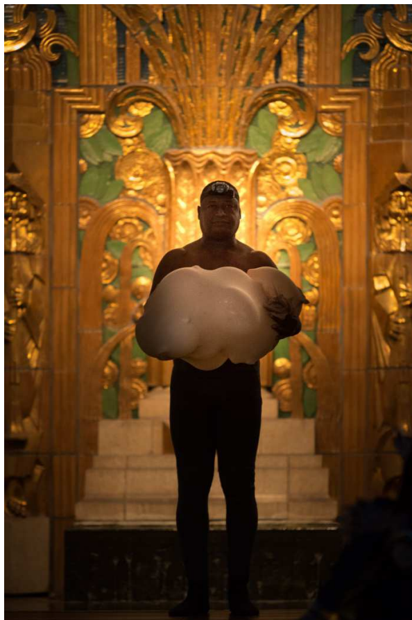
Bubbles by H.Tauliaut at The Wolfsonian

If you are interested in renewing your support to the Tout-Monde Festival in 2020 or launch a new partnership to help supporting Caribbean contemporary artists, please contact Vanessa.selk@diplomatie.gouv.fr or martine.johnston@diplomatie.gouv.fr .