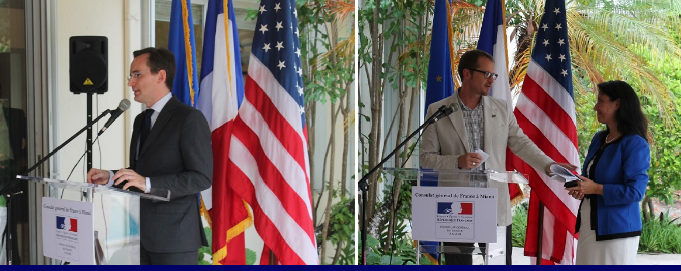
Hon. Clément Leclerc, Consul General of France