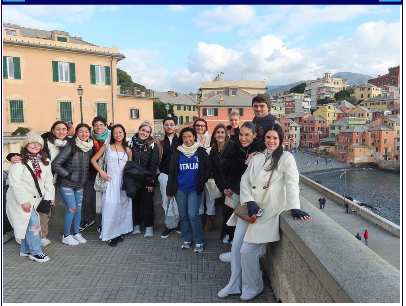
At the port of Genoa with FIU students