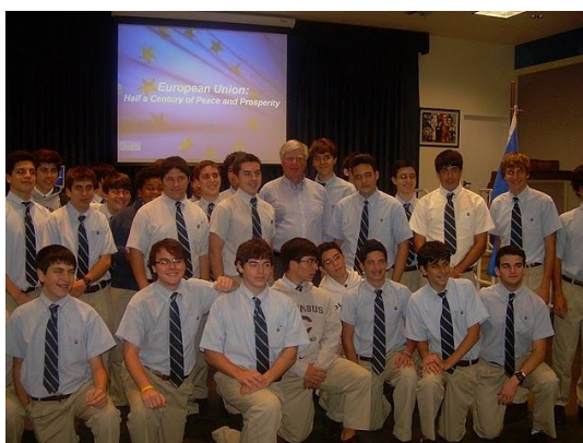
Sophomores of Christopher Columbus Senior HS