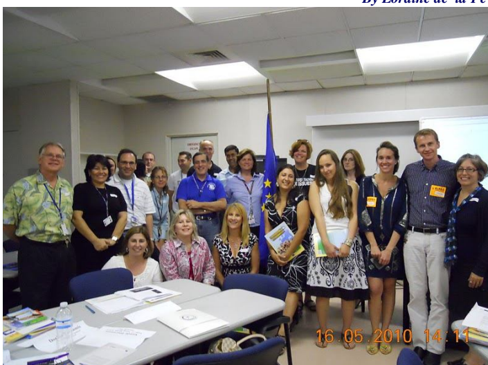
Broward Teachers and Instructors