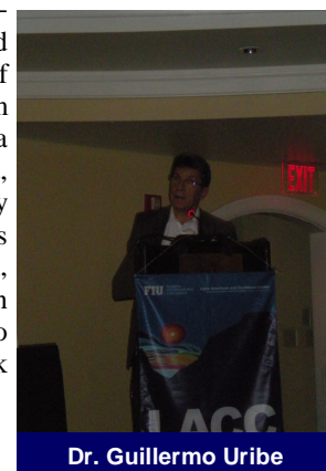
Dr. Guillermo Uribe

nomenon of how Islam in the European imagination during the mid-20 th century was "the other" but today it has placed itself permanently in Europe. For Uribe, the central question today is "What does it mean—a European Islam? What does it mean in Europe when Islam is no longer a religion of immigrants?" To answer this, Uribe discussed the ways that Islam entered Europe in the 20 th century, an era where the story of human migration changed from the movement of peoples from the most populated territories to least while now it is from the least populated territories to the most. Uribe adds, "Europe went from being a territory of immigrants to a continent that receives people from the countries it colonized." According to Dr. Uribe, this is actually the 3 rd and not the first time in European history that the question of religious integration into the