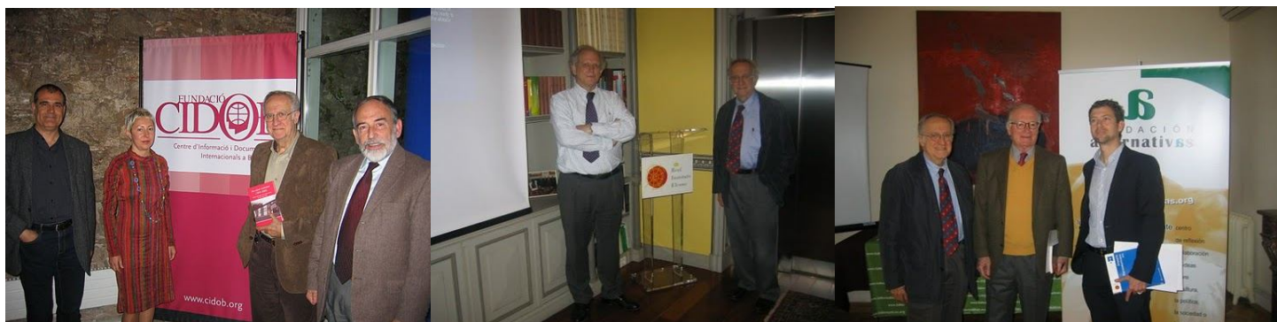
University of Barcelona, Spain, April 8, 2010 Real Instituto, Eclano, Spain, April 12, 2010 Fundación Alternativas, Spain, April 15, 2010