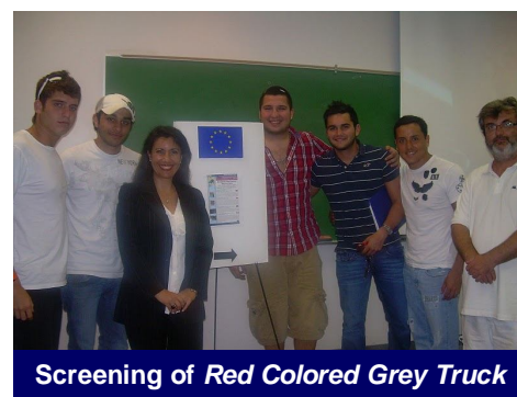
Screening of Red Colored Grey Truck