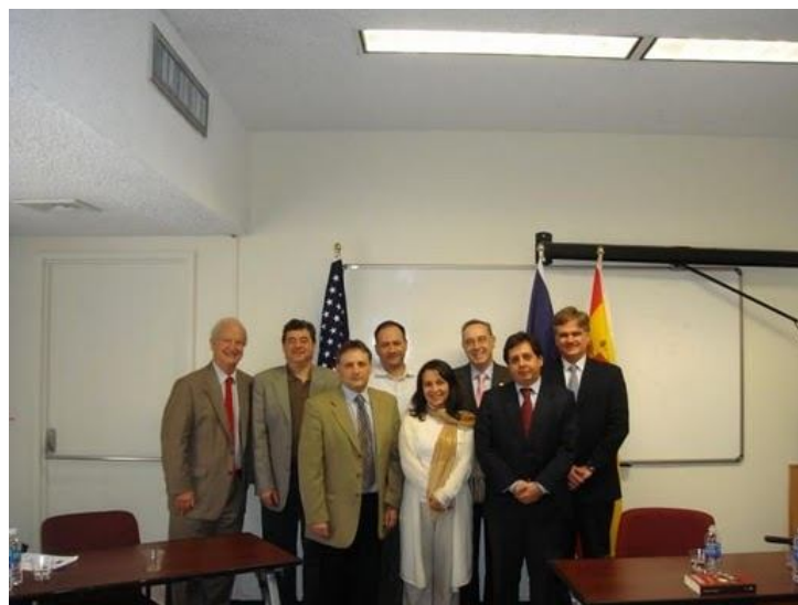
Participants of the Seminar