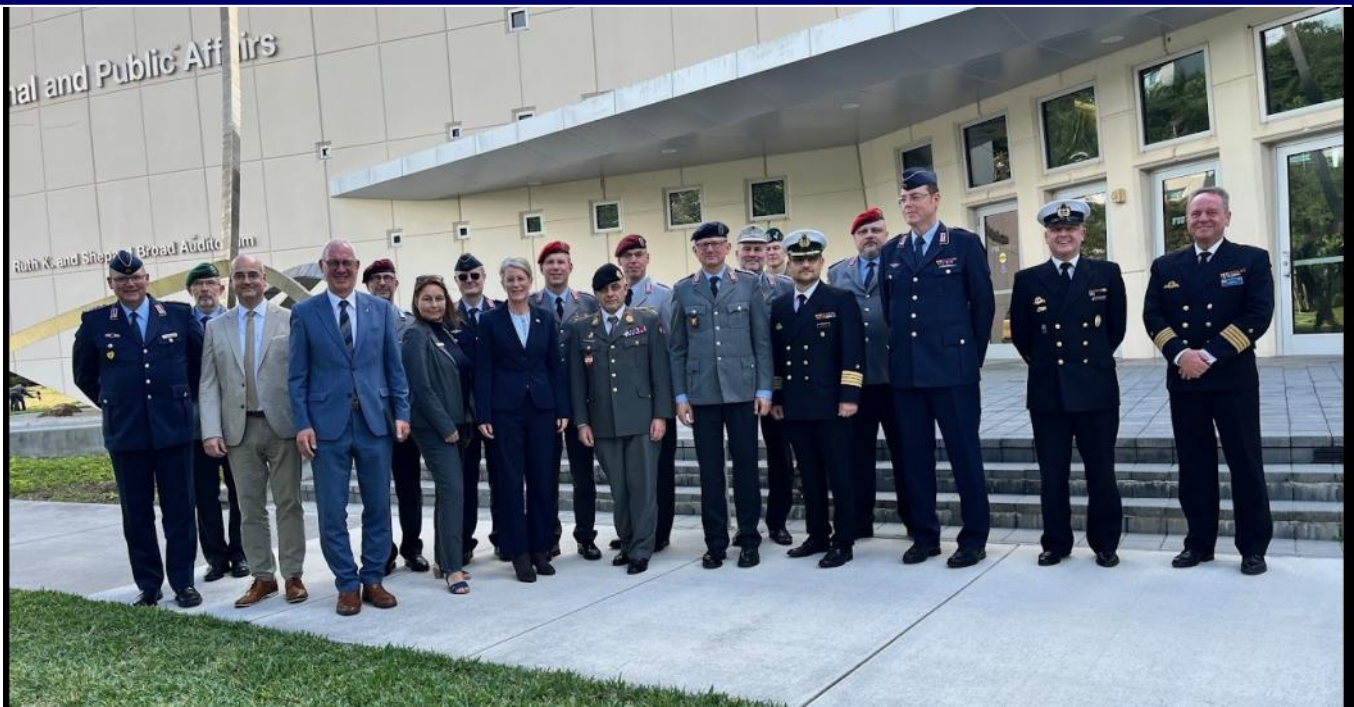
Leadership Academy of the Bundeswehr

In November, the Miami-Florida Jean Monnet Center of Excellence proudly hosted a distinguished delegation from the Leadership Academy of the Bundeswehr for an intensive seminar on transatlantic relations, global security challenges, and the evolving U.S.-EU security partnership .