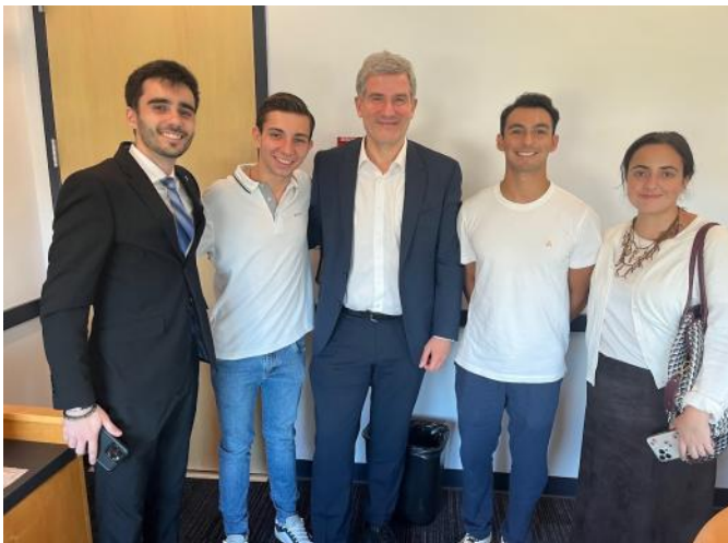
Metin Hakverdi with FIU students