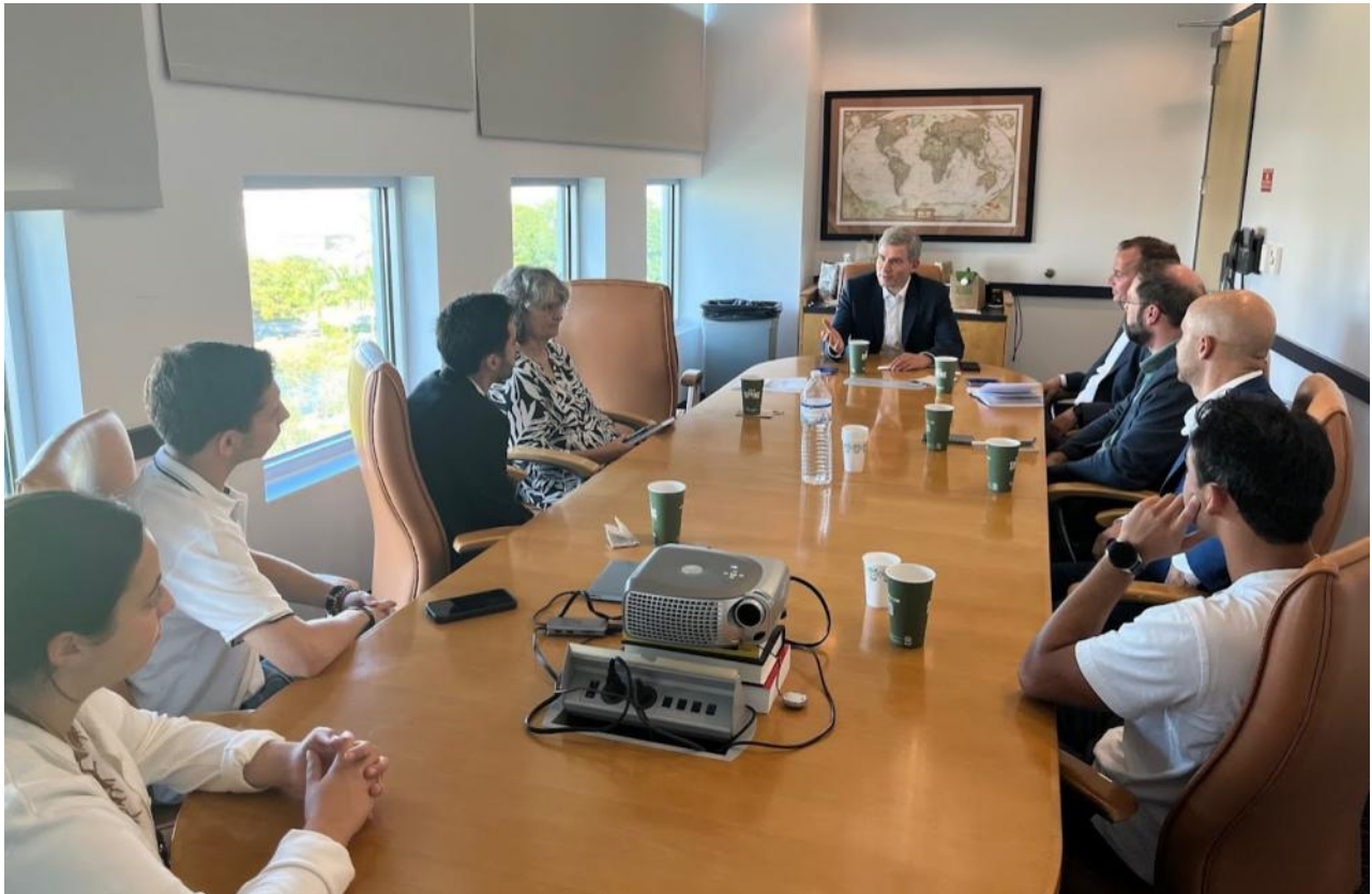
Metin Hakverdi, German Government's transatlantic coordinator with FIU students and faculty