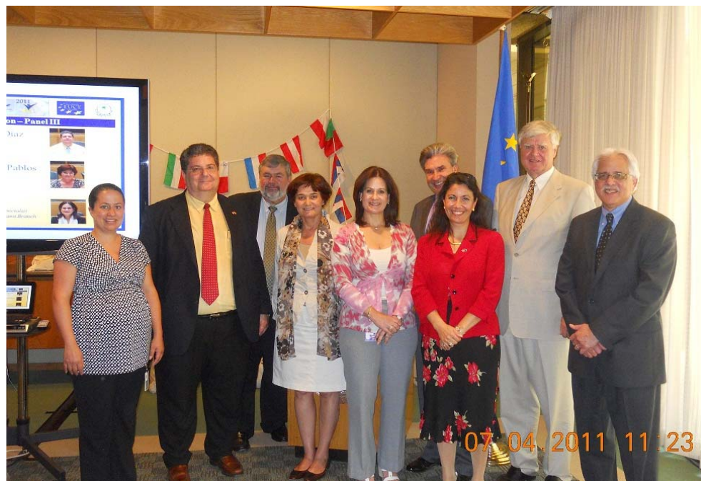
Local Euro Challenge Competition 2011 Recognition Awards at the Federal Reserve Bank of Atlanta- Miami Branch: students, judges, and Federal Reserve Bank officials