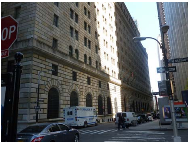
Federal Reserve Bank in New York