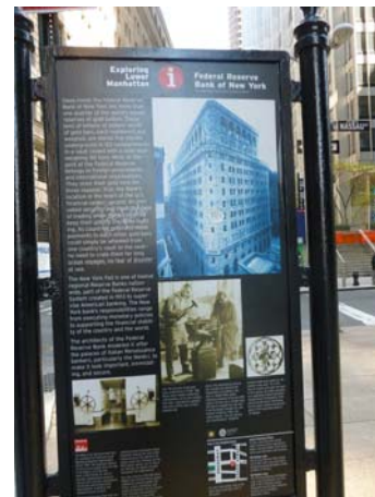
Federal Reserve Bank in New York