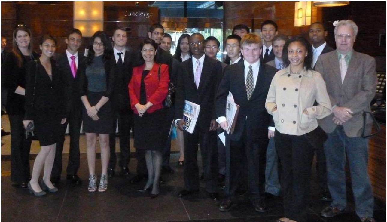
The three Florida teams with their teachers: Coral Gables Senior HS, FPW Marine & Oceanographic Academy, and Miami Palmetto Senior High School