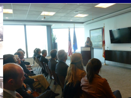
Audience at Gray Robinson